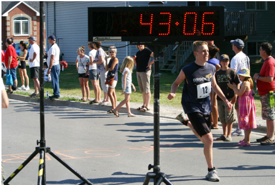
Figure 5.2 Elapsed time for a foot race is the same for all observers, but at relativistic speeds, elapsed time depends on the motion of the observer relative to the location where the process being timed occurs.

Consider how we measure elapsed time. If we use a stopwatch, for example, how do we know when to start and stop the watch? One method is to use the arrival of light from the event. For example, if you're in a moving car and observe the light arriving from a traffic signal change from green to red, you know it's time to step on the brake pedal. The timing is more accurate if some sort of electronic detection is used, avoiding human reaction times and other complications.